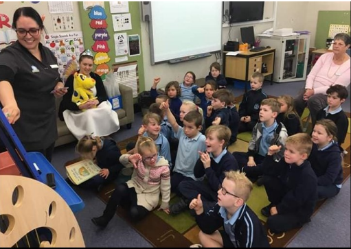
Tooth Fairy Visit- Happy Tooth Dentist